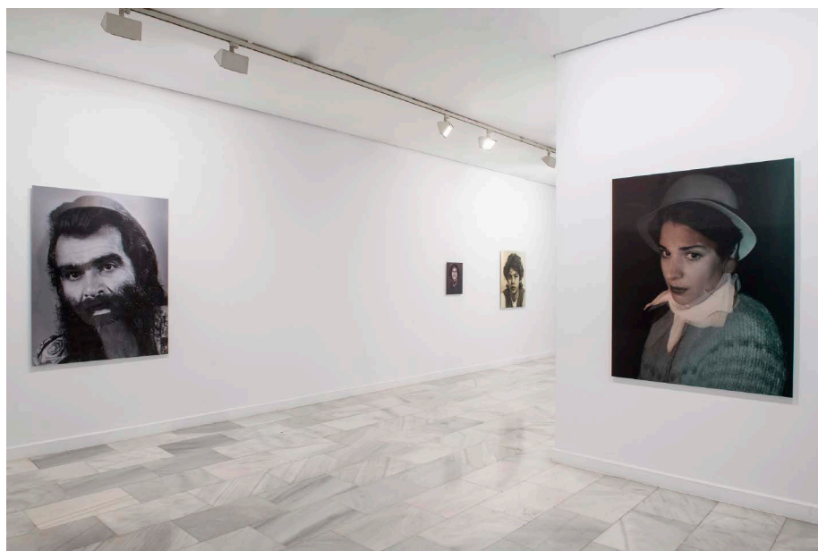
IDENTITY. 2019. 9 lenticular photographs. Installation view for the exhibition KNOW US. March - June 2019 at CAAM - Centro Atlántico de Arte Moderno. Canary Islands, Spain.