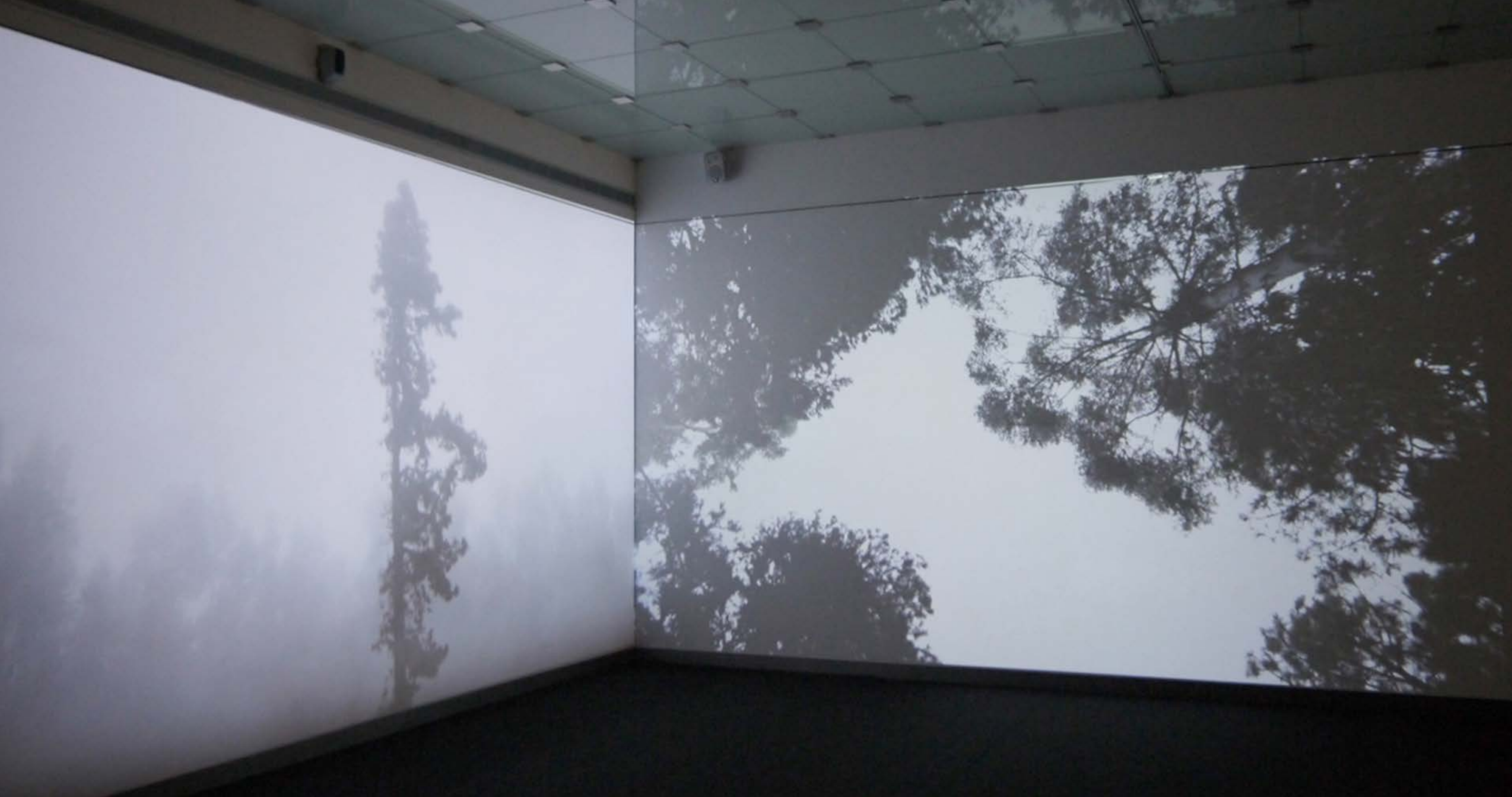
Installation view at Museo de Naturaleza y Arqueología de Tenerife, 2014 Two-channel video installation. Continuous running. Variable Dimensions.