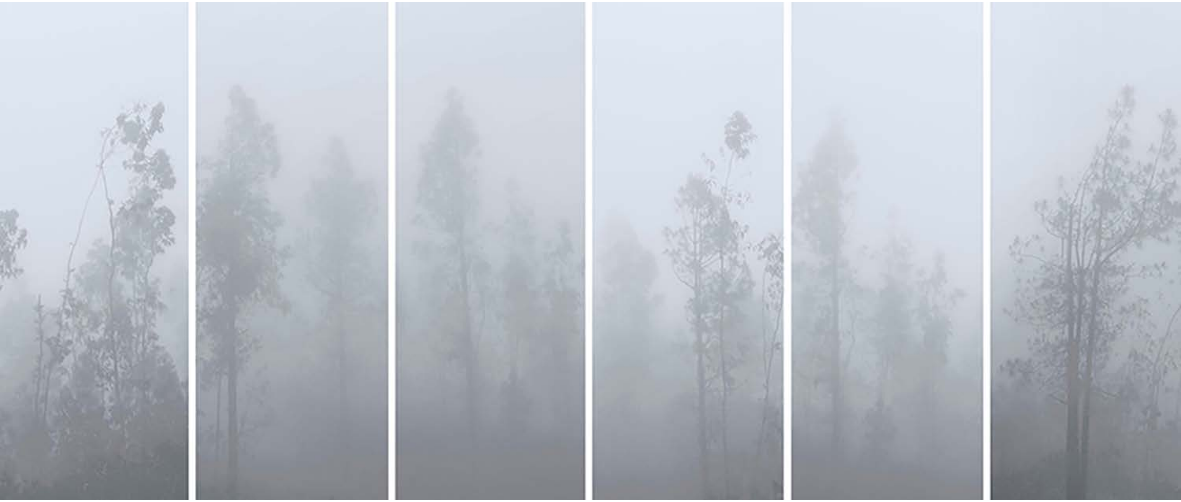
Six photographs, 98 x 275 in.