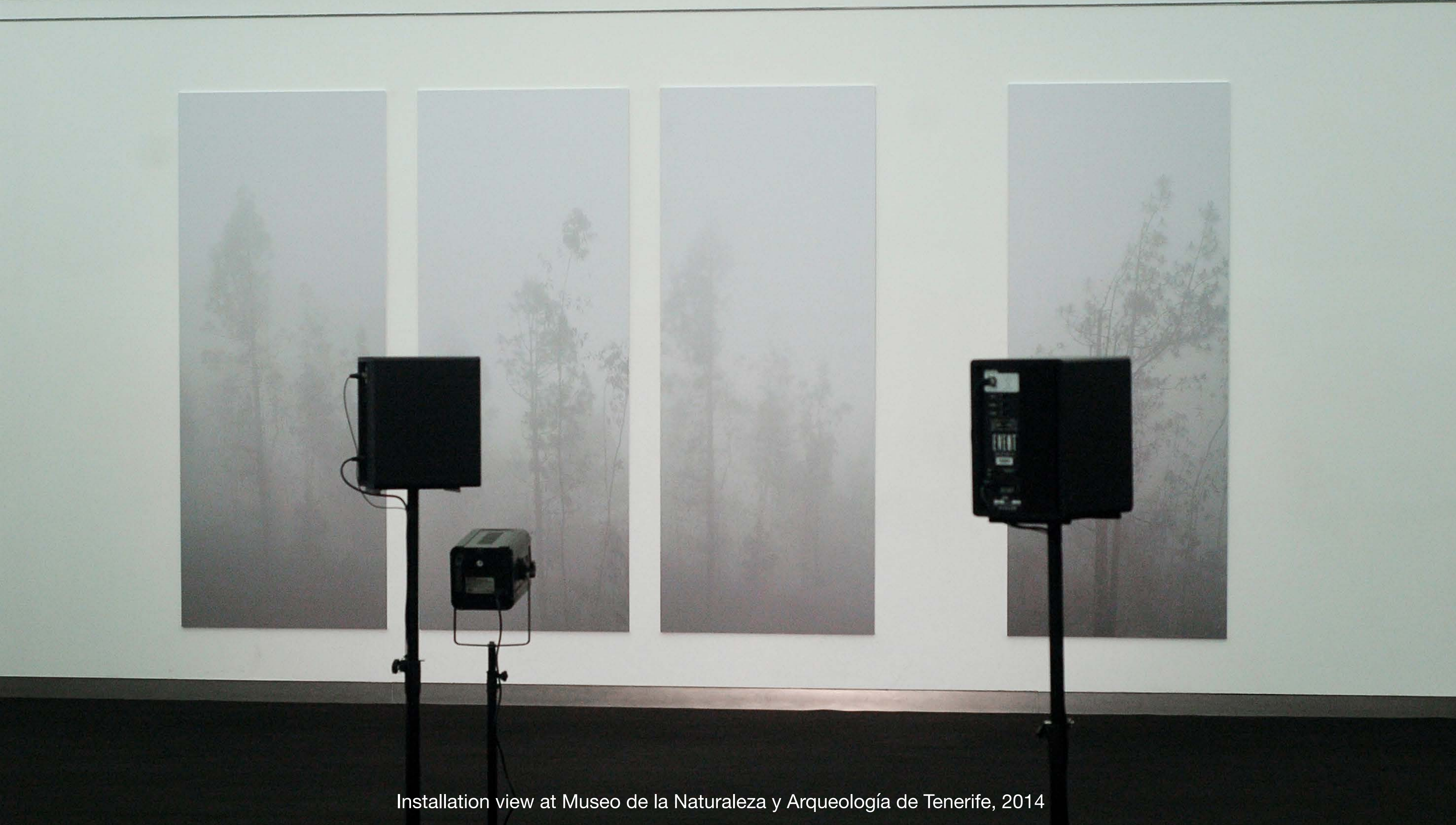
Installation view at Museo de la Naturaleza y Arqueología de Tenerife, 2014