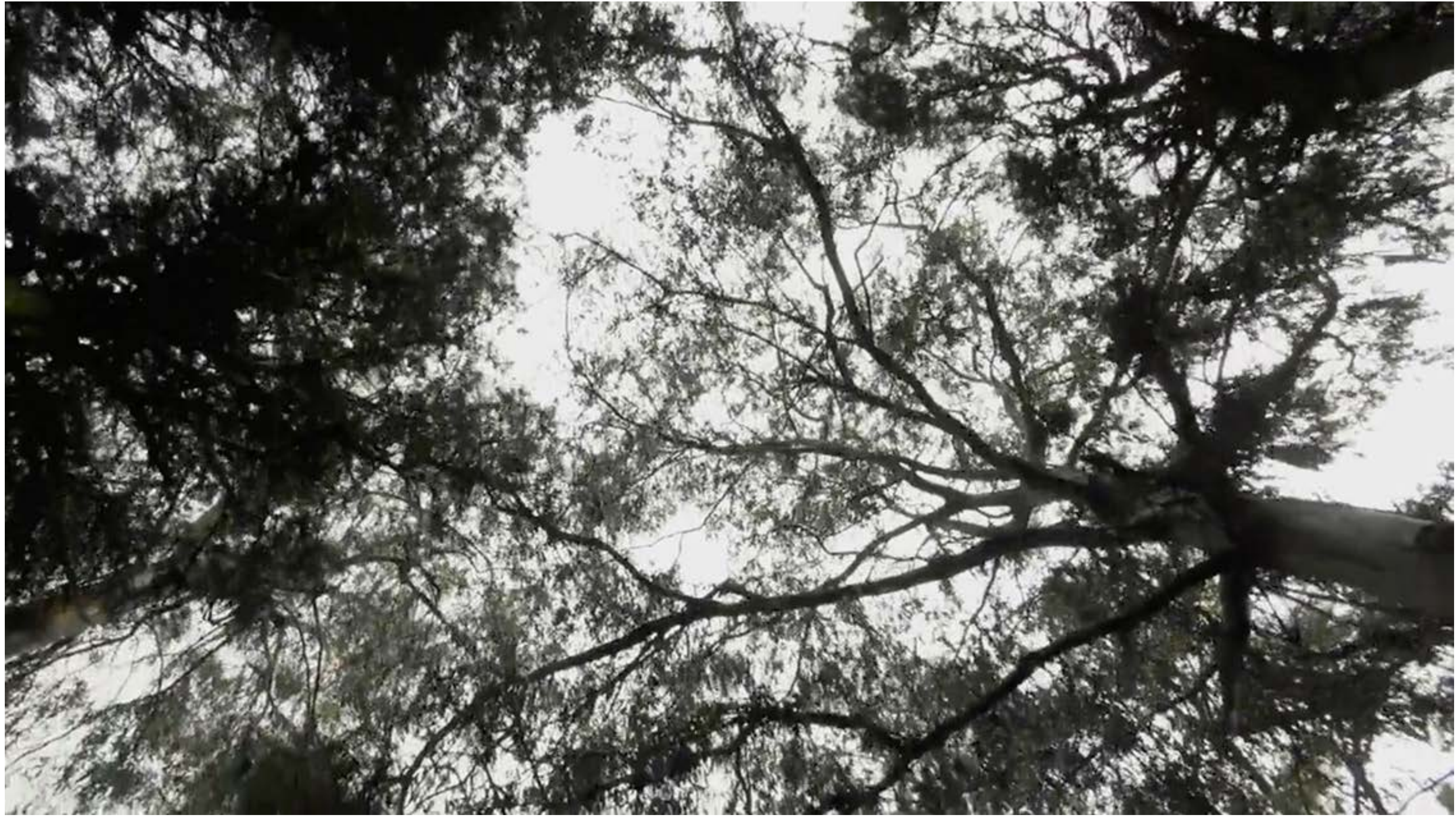
Video still of 'Observatory', 2014. 5'14"