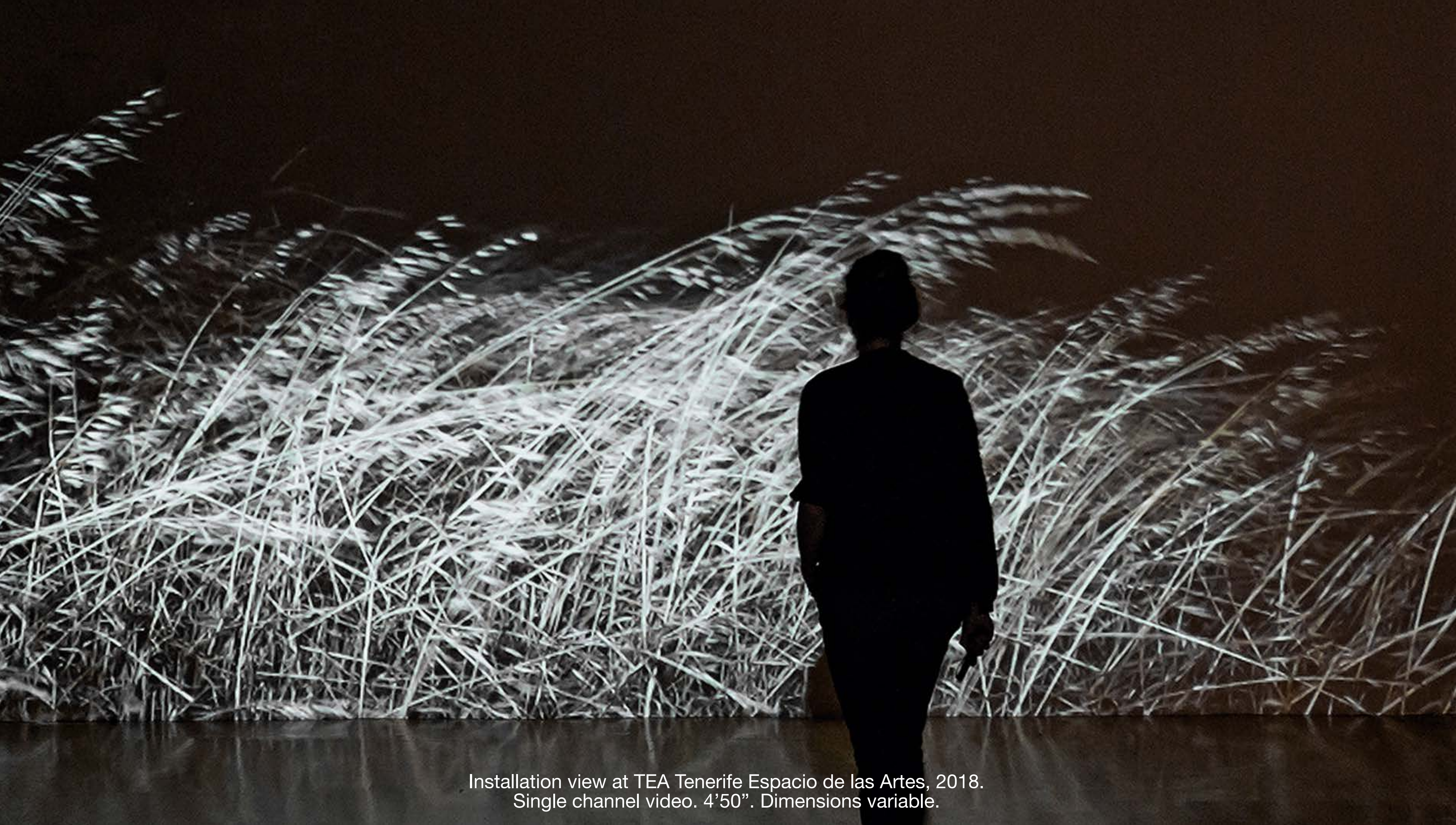
Installation view at TEA Tenerife Espacio de las Artes, 2018. Single channel video. 4'50". Dimensions variable.