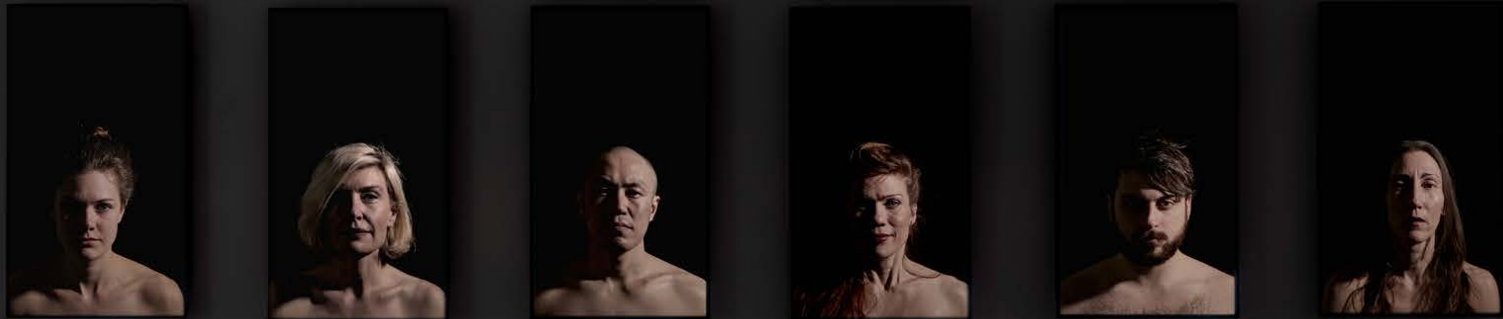
Installation view at TEA Tenerife Espacio de las Artes, 2018 Six-channel video installation.