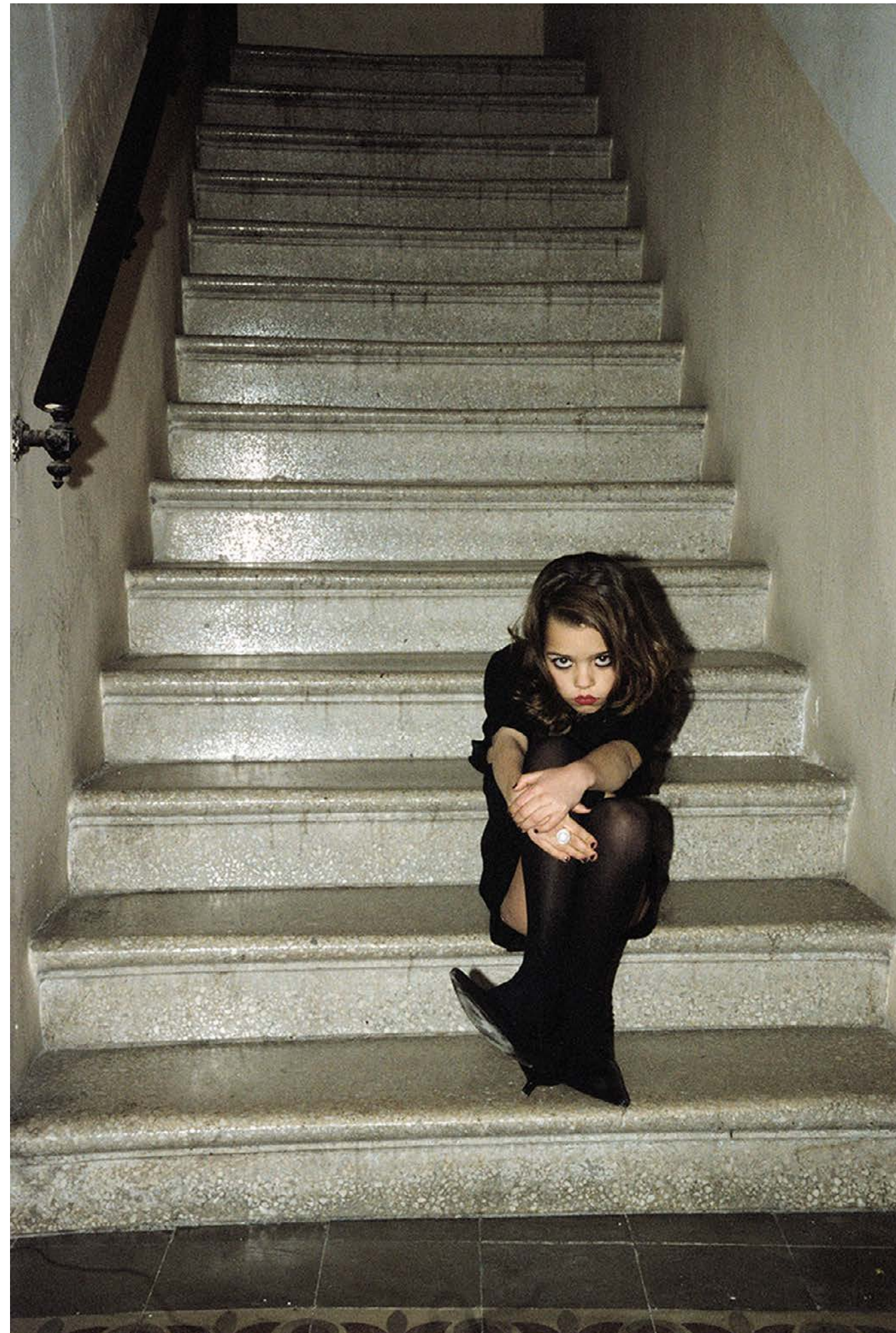
Lo-li-ta, 2018, 86 x 57 in.