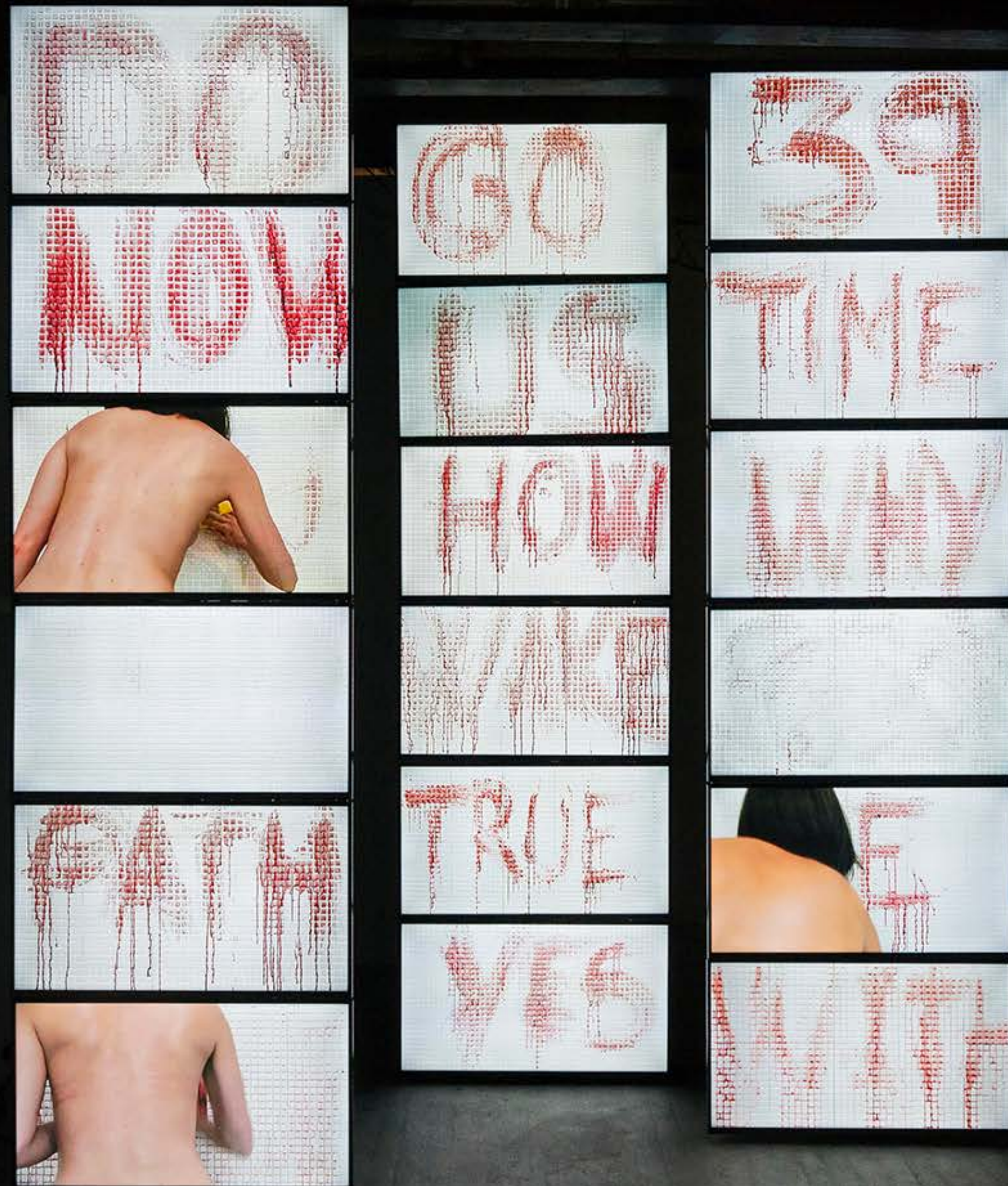
Installation view at Catinca Tabacaru, New York, 2019. 18-channel synchronized video installation with sound.12'05"