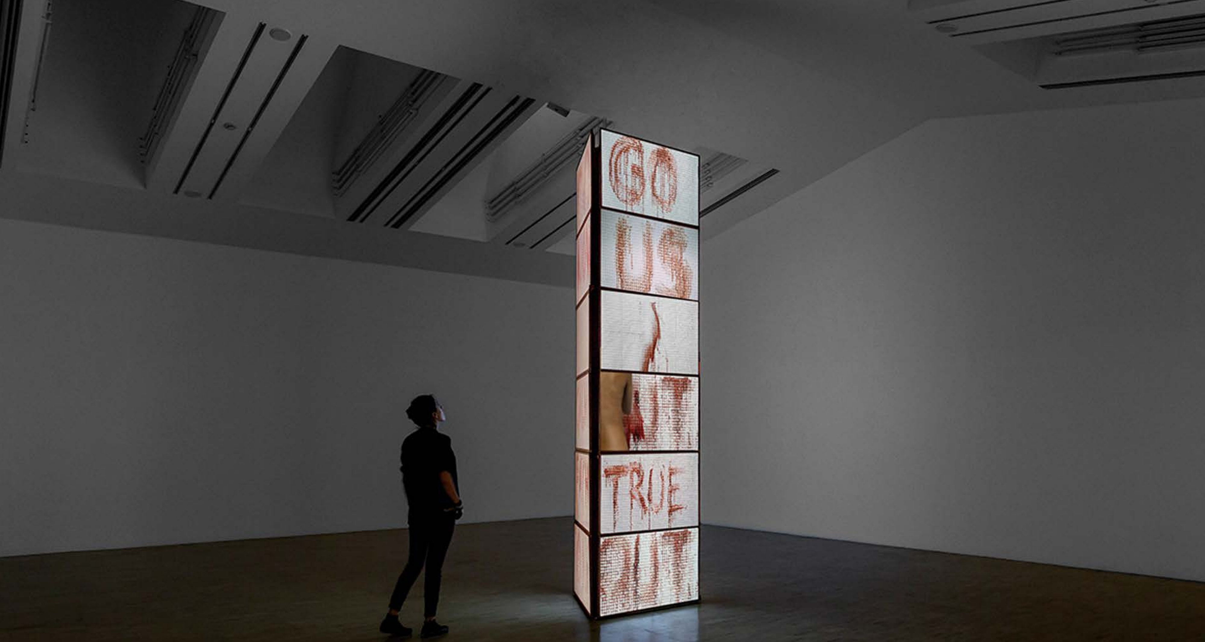
Installation view at TEA Tenerife Espacio de las Artes, 2019. 18-channel synchronized video installation with sound. 12'05"